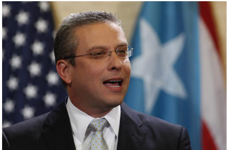
Governor Alejandro García Padilla

Hedge funds and billionaire hedge fund managers have played a major role in the crisis.