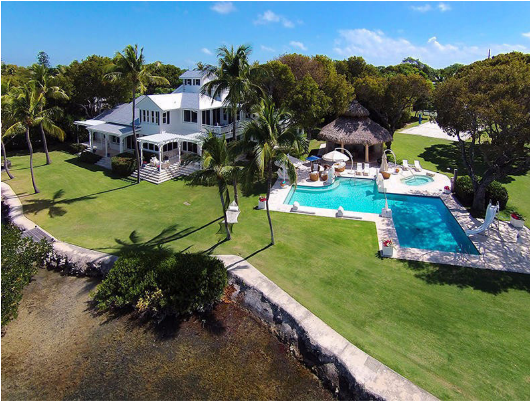
Paul Tudor Jones Mansion in Key West, FL

AUSTERITY POLITICS: In a recent speech in which he raised concerns about inequality, Jones said that higher taxes weren't on his "bucket list," and that instead he wanted to see businesses comply with voluntary ethical standards. [41]