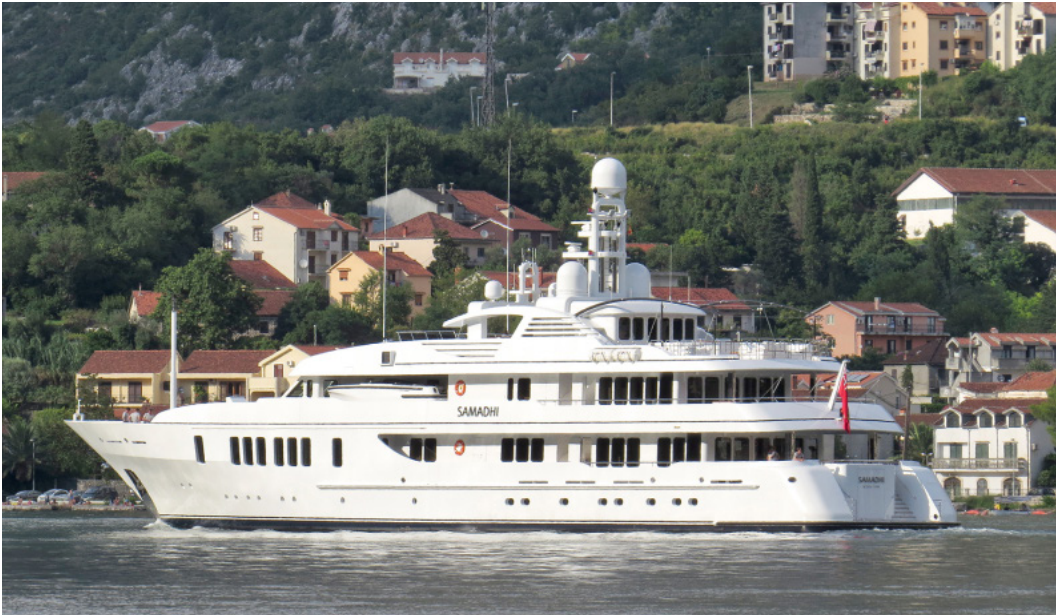
Dan Loeb's superyacht, Samadhi

BILLIONAIRE WEALTH: Loeb is worth $2.5 billion, according to Forbes. [55]